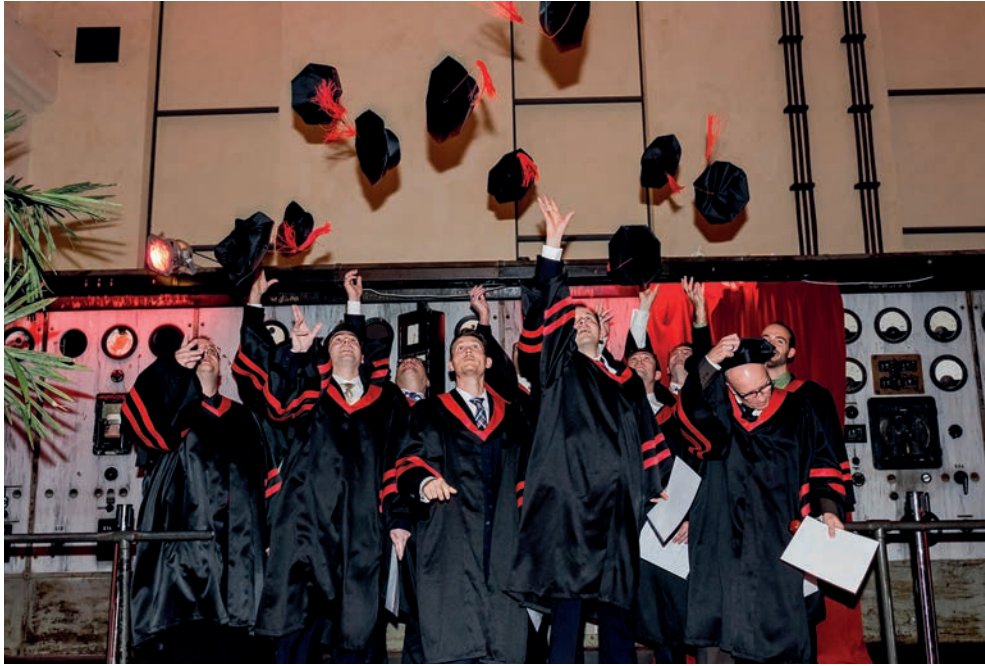
< Executive MBA Graduation Ceremony